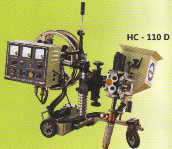
HC - 110 D