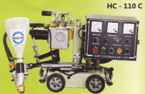
HC - 110 C