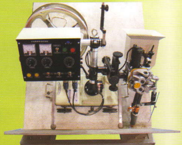
HC - 110 A